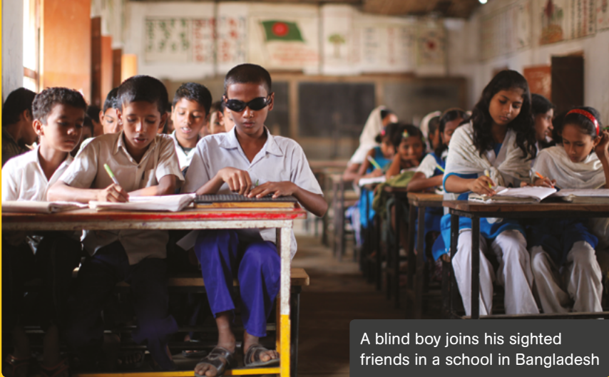
A blind boy joins his sighted friends in a school in Bangladesh