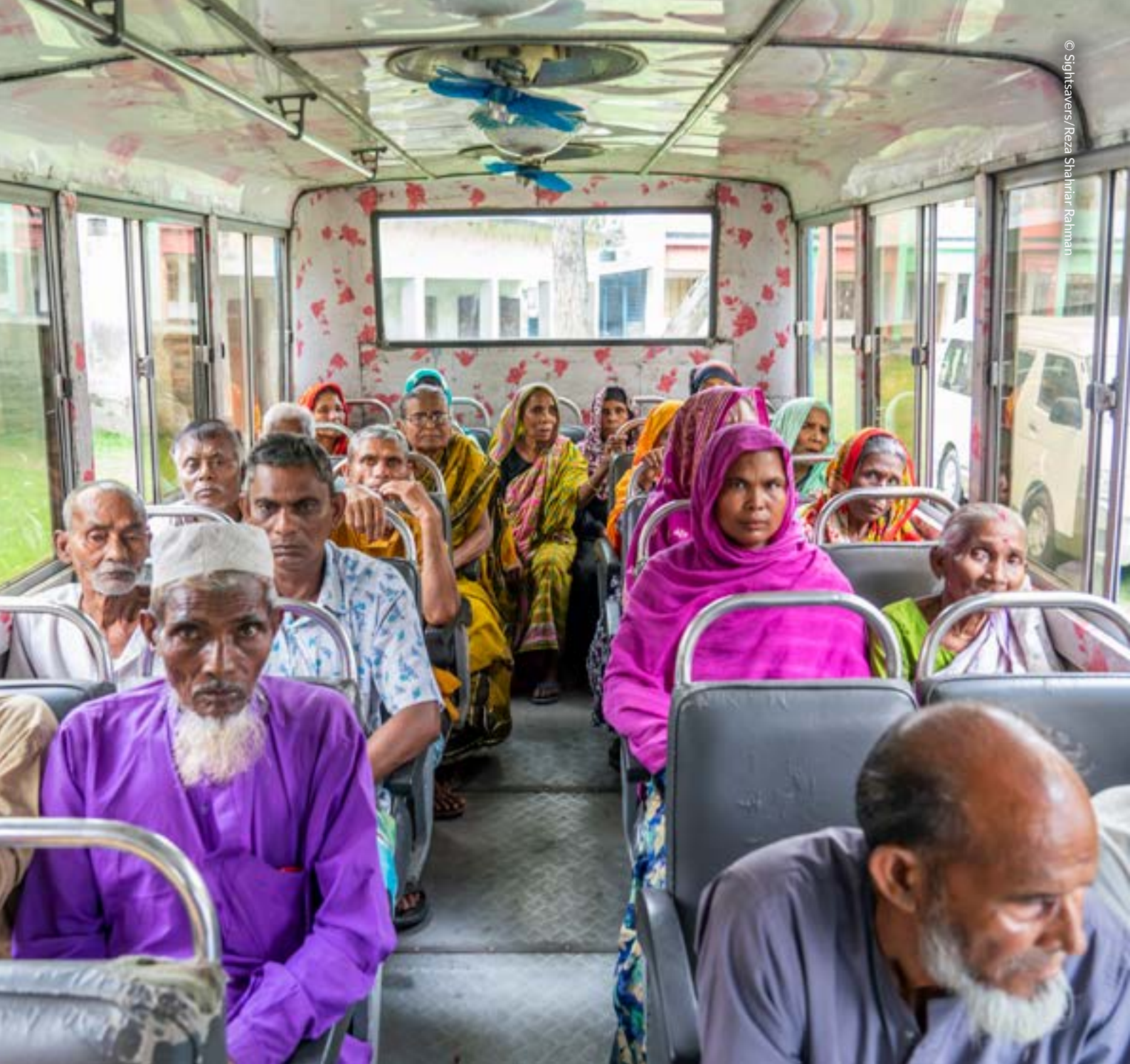
Cataract surgery patients on the way to an eye hospital in Kurigram, Bangladesh.

An important pillar of our inclusive eye health model is the principle that working in partnership with local stakeholders is an effective strategy to reach people experiencing increased marginalisation in society, such as women and girls, people with disabilities, ethnic minorities, older people and displaced people. In each project, we involve underrepresented groups in