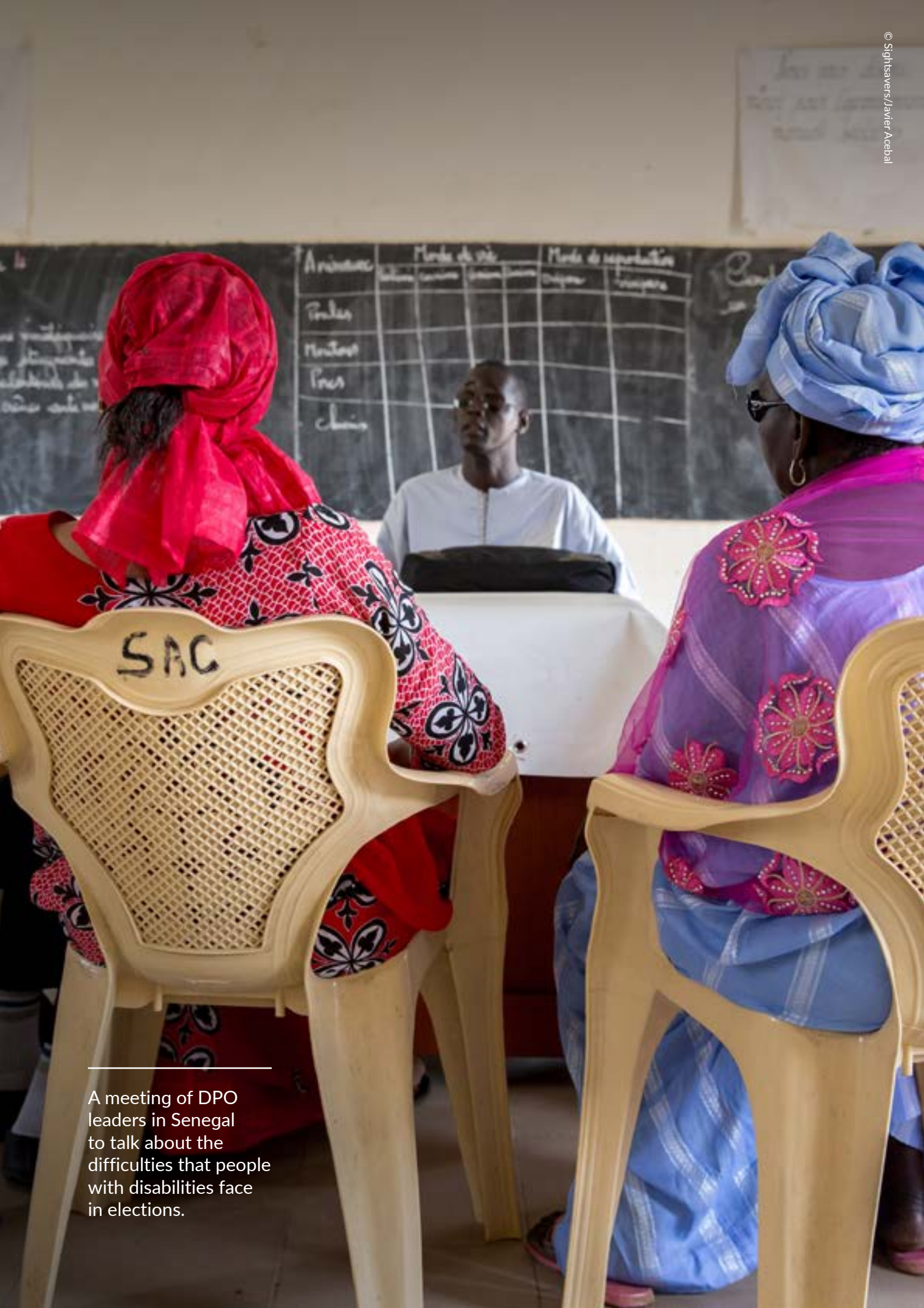
A meeting of DPO leaders in Senegal to talk about the difficulties that people with disabilities face in elections.