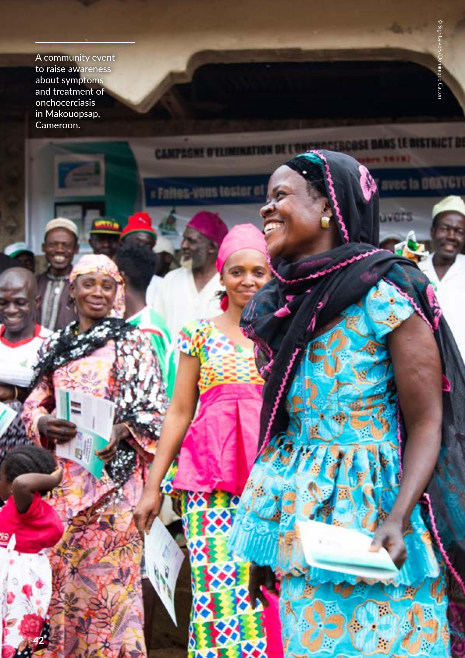
A community event to raise awareness about symptoms and treatment of onchocerciasis in Makoupsap, Cameroon.